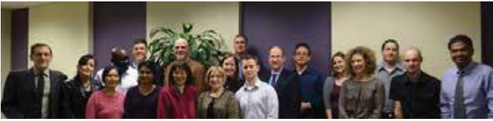
AutoIMS employees and the AASC board of directors